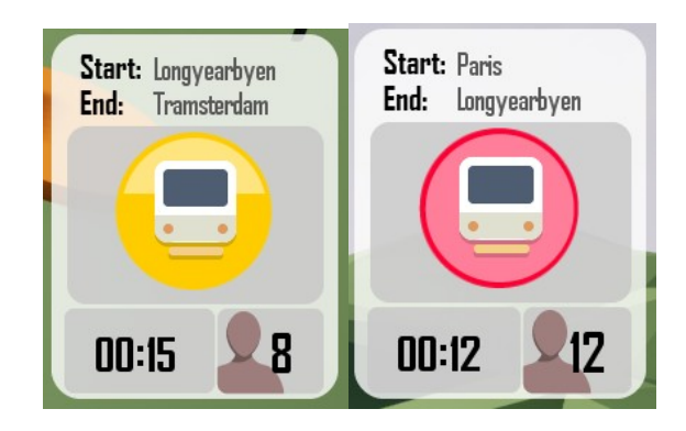
Fig. 2. Train cards with the route information and train properties.

To ensure the player was met with non-linear and unpredictable routing, a method had to be devised to ensure that the routes traveled by the trains within the game are random. Hence, an array of stations was created, and a random timer derived from the game engine determines whether an event should be generated at any random given moment. The routes generated take a start and end station, which can be connected directly but usually consist of at least a single stopover station between them. This utilizes more of the track, requiring more sections be operational to keep a high happiness score. The route uses the track pieces found within the game world to determine the most efficient route to get to the destination station.